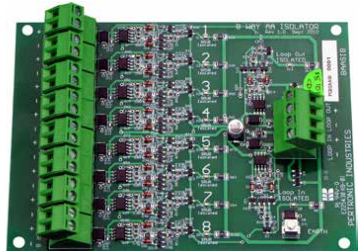
Pertronic Analogue Addressable Isolator Board – 8 Spur (8SAAIB)

In addition, this board has input and output isolators. These ensure that if the 8SAAIB is installed remote from the fire panel, a short-circuit on one side of the loop will not affect the operation of connected spurs or the other side of the loop circuit.