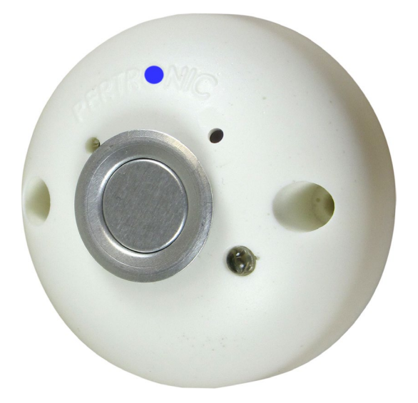
Pertronic Conventional Indicating Heat Detector (V Series)

Please refer to our website for information on other types of heat detector, including remote indicator, remote kit, and alkaline wash resistant types.