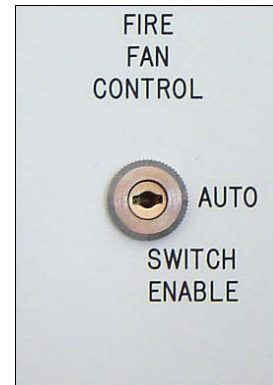
Fan Control Key-Switch

The Fan Controller , used to control a particular fan through a building services interface, consists of two principal modules and two optional modules: