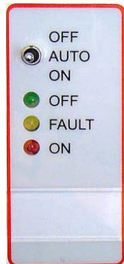
Fan Control Unit

The Fan Controller has been designed to comply with AS1668.