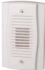
MHW UL S4011