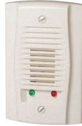
APA151 UL S4011