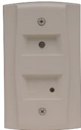
RTS151 UL S4011

System Sensor provides system flexibility with a variety of accessories, including two remote test stations and several different means of visible and audible system annunciation. As with our duct smoke detectors, all duct smoke detector accessories are UL listed.