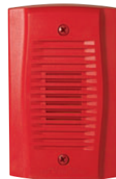
MHR UL S4011