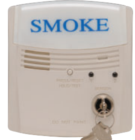
RTS2-AOS UL S2522