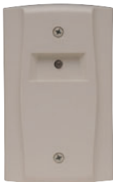
RA100Z UL S2522