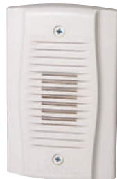
MHW UL S4011