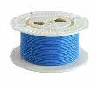
Pertronic-Anbesec Linear Heat Detection Cable on 200 Metre Drum