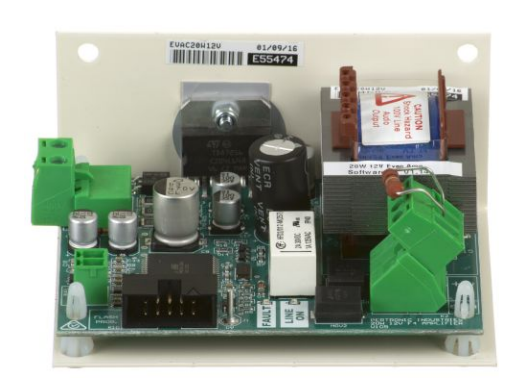
Pertronic 20W, 12V Amplifier EVAC20W12V