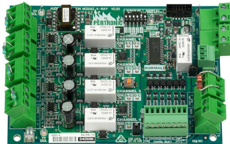
Audio Distribution Module 4-Way (ADM-4)

The module also includes a Form-C clean contact fault relay for connection to monitoring equipment. Optionally the module can signal a fault condition by switching a 6.8 kΩ fault resistance across the incoming audio lines. If required, the Audio Distribution Module can be configured to ignore faults in the active state, allowing for further downstream switching (for example, using the System Sensor M500S).