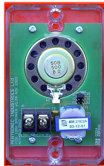
Pertronic PSS1 100 Vrms Speaker (1.1 W max)