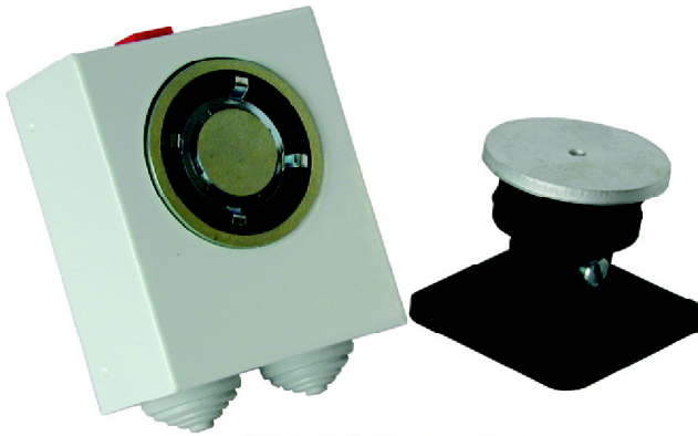
WMAG-DR-24 WMAG-DR-24-50 WMAG-DR-240-50