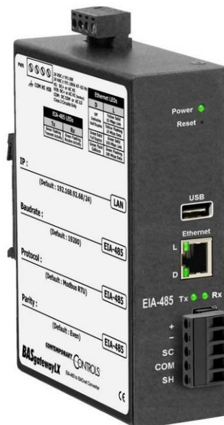
BASGatewayLX Gateway Module

The gateway system consists of a contemporary controls BASGatewayLX Gateway Module connected to a Pertronic Industries GPIB-M Modbus Interface. The system is normally installed inside the fire alarm cabinet. It connects to the BMS physical network via an Ethernet port.