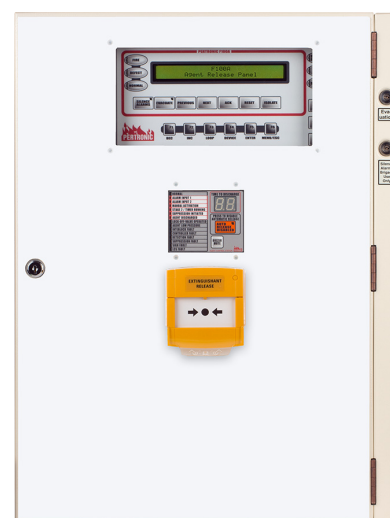
F100A Extinguishing Agent Release Panel