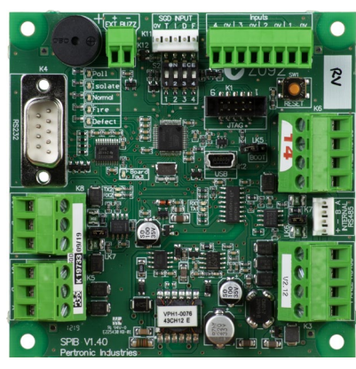
Pertronic ASCII Text Interface for Printer, Pager, Nurse Call Pager, & Special Purposes SPIB-NCPP

The template can include literal text. This includes ASCII formatting characters such as tabs, form feeds, and carriage returns.