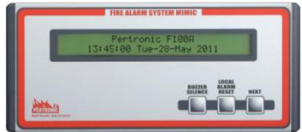
F100A LCD Mini Mimic