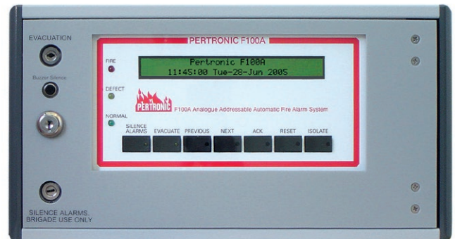
Pertronic F100A LCD Mimic

In 'slave mode', system messages are displayed but no command interaction is available, except for silencing the in-built buzzer.