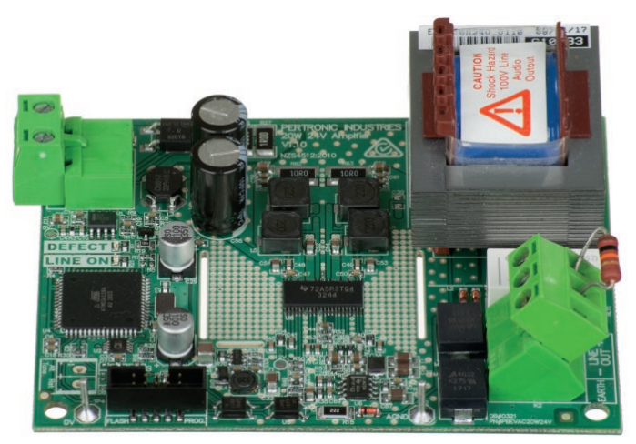
Pertronic 20 W, 24 V Amplifier