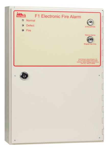
The Pertronic F1-3