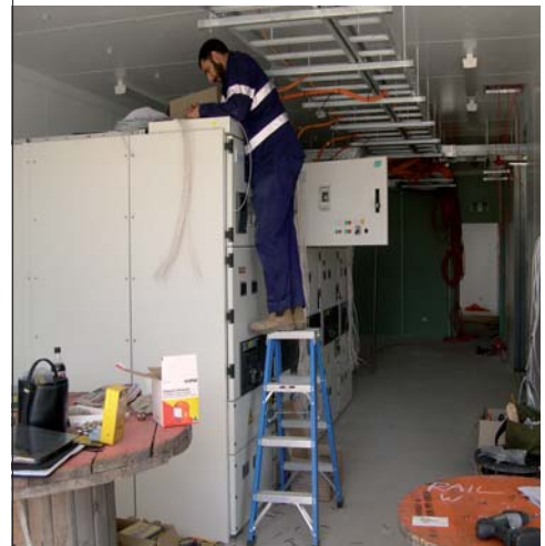
Capillary tubes branch off the main VESDA sampling pipe and into the equipment cabinet, allowing the earliest possible warning of smoke within the cabinet.