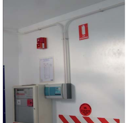
A VESDA detector can be installed inside the portable substation or switchroom whilst it is being built or retrofitted onsite.