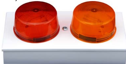
Figure 1 Dual Alert-Evac Strobe